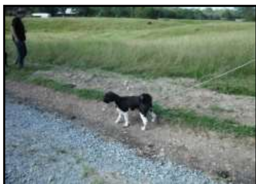
Left: On the job!

Track and Search. This was where the hard work started. Tracks went from country paddocks, to city parks, but I took the three tests for my TSD title in my stride. Not being a dog who lived in the city and unused to all the traffic and people, it took me until Easter 2017 to obtain the rest of the 10 qualifications needed in Track and Search, to become a Grand Champion. The first four of these took place in city parks, which wasn't too bad, but then they took me onto the suburban streets, and everything was different. The final straw was when the silly person who got lost, got into a car, and then obviously decided they didn't like the driver or something, and got out again. So I had to follow all that too.