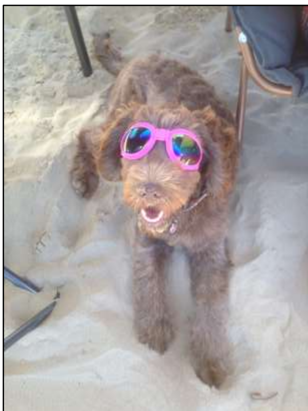
(Left) Gracie at the beach a few days ago at Yeppoon. She is a 6 month old labradoodle training to be a therapy dog. Megan Feil