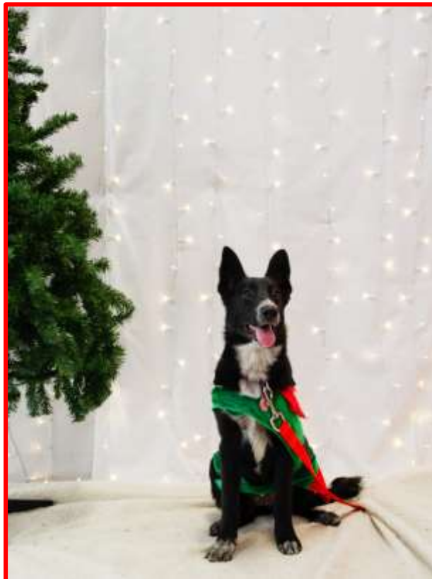
Above : 5 month old Border collie x Shepherd Shae all set for her first Christmas